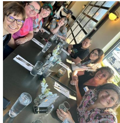
UWYC Staff enjoying lunch and mimosas at Sophie's Kitchen

We are grateful for the support of local businesses like Sophie's Kitchen, Black Orchid Yoga, and Fresco Juice Co., who are dedicated to making a difference.