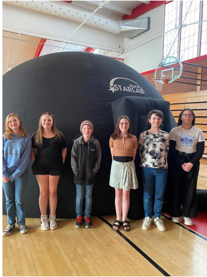
Discover Zone kiddos and the STARLAB

Volunteer, share a skill, or host a booth at our Carnival