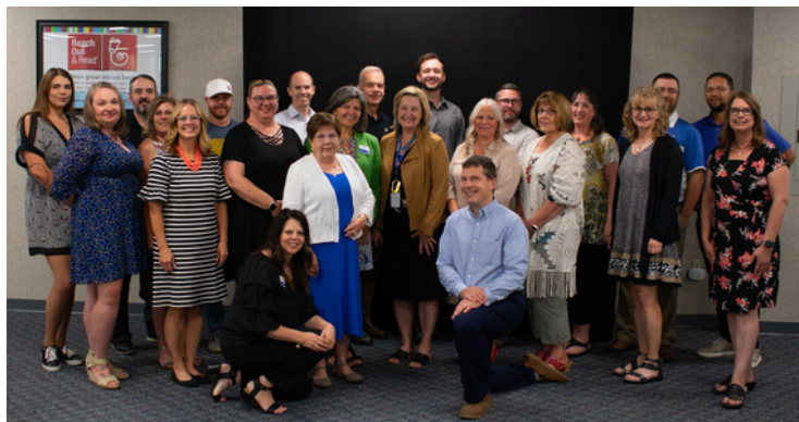
2023 Members of the Board of Directors and United Way Staff