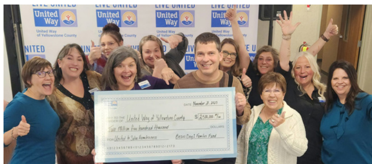
United Way Staff celebrating Bezos Day 1 Families Fund Grant Award

Day of Action is our largest annual, strategic volunteer program created to help advance the common good in our community. This year's project was at Dover Park and in partnership with the Yellowstone River Parks Association, where projects included removing invasive species and trail building to landscaping. 200 people participated.